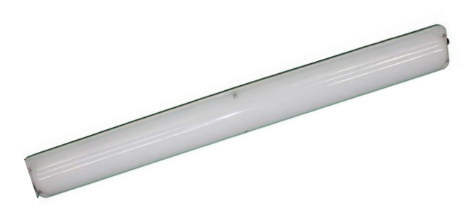
Designed in Australia to comply with the requirements of AS/NZS CISPR15: 2011